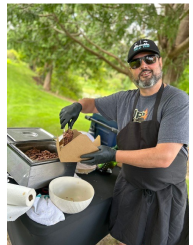
JP's BBQ & Catering