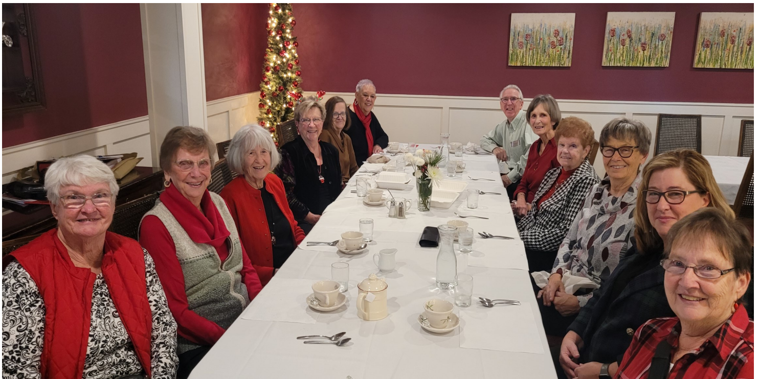
Port Dover Christmas Luncheon