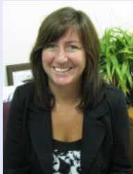
Kim McGillivray Foundation Gift Processing

I'd definitely travel. I'd take all of my friends on a cruise to somewhere warm and tropical. Then I'd help my family and friends financially.