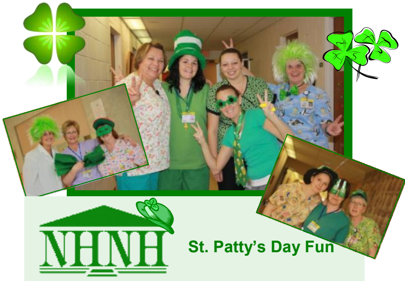
St. Patty's Day Fun

On Wednesday March 17th, staff and residents at NHHH decided to take up the St. Patrick's day excitement by dressing in green and showing their St. Patrick's day dedication. The activities included the residents in the excitement with a St. Patrick's day party on the upper floor with Green punch and green treats, balloons and themed party games while residents on main floor had a chance to win a prize and play St. Patrick's day Bingo. Everyone had a great time.