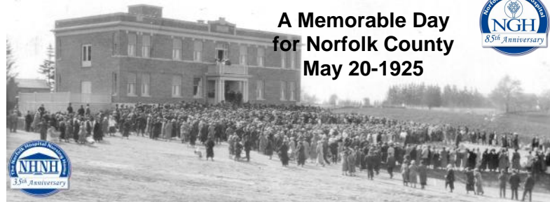
A Memorable Day for Norfolk County May 20-1925