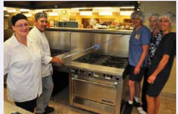
The Foodservices team hold an official ribbon cutting ceremony to introduce the new equipment.

They’ve helped to cook alot of wonderful meals for patients, staff and visitors over the last 40 years, but there comes a time when even the ovens must call it a day. On June 13, the Nutrition and Food Services Department anxiously welcomed a new set of ovens to their kitchen. Removal and installation took place in one day and did not cause any disruption to the menu as sub sandwiches were prepared for lunch service. Thanks to the maintenance staff for their assistance in making this a smooth transition.